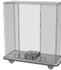
Standard Electric Thermal System