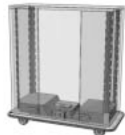
Quad-Heat™ Dual Fuel Thermal System