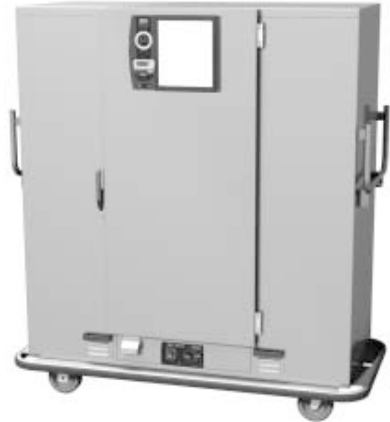
MBQ-180-QH — 180 Plate Capacity with Quad-Heat™ Dual Fuel