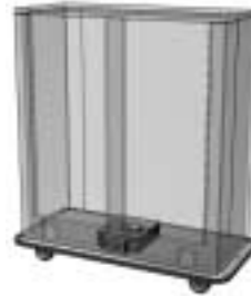
Standard Electric Thermal System