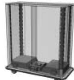
Quad-Heat™ Dual Fuel Thermal System