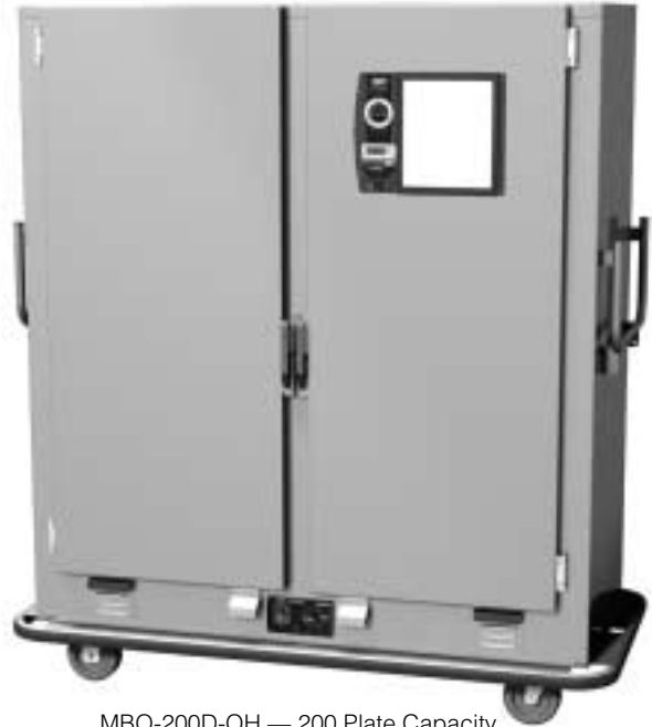
MBQ-200D-QH — 200 Plate Capacity with Quad-Heat™ Dual Fuel